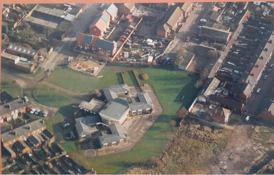
Aerial view of St Faith's School before modification and redevelopment

The school's numbers increased from 1984 following the closure of St. Martin's First School, which had been located near the top of Beaumont Fee, and the younger children from there duly joined St. Faith's Infant School and Nursery. The older children joined the school on Hampton Street, as reflected in the name being amended to St. Faith's and St. Martin's Junior School.