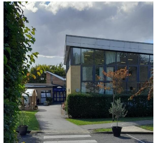
Main entrance to St. Faith's Church of England Infant and Nursery School ( Nigel Horner )

Welcome to St Faith's Infant and Nursery School, and our golden jubilee in this location – although our story is part of education provision in Lincoln's West End going back nearly 150 years.