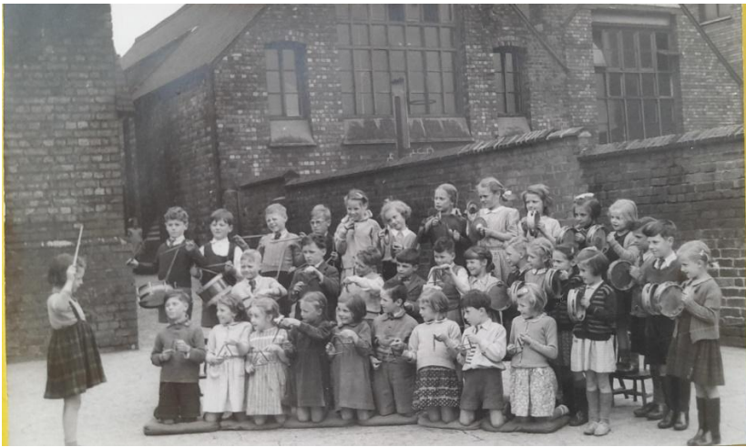
Children in the former St. Faith's School playground